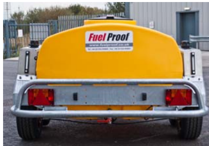
Rear bumper with road legal lighting system