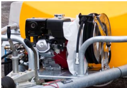
Pressure washer unit and hose reel